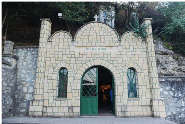
The cave of Saint Apostle Andrei

In the small church is kept a saint reliquary with the relics of Saint Andrei. It is a cross in the shape of an X, in front of the Holy Altar, on the left side. In the center of the cross there is a small part from the finger of Saint Apostle Andrei, brought from Trifiliei Metropolitan Church from Greece and on the four sides of the cross are little parts from the holy relics of the Saints from Dobrogea: Zoticos, Attalos, Kamasias and Filippos , the Saint Martyrs from Niculitel, Epictet the priest and Astion the monk.