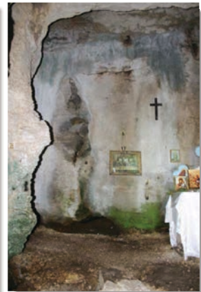
The cave of Saint Ioan Casian