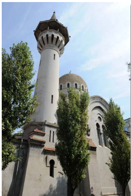
The Big Mosque from Constanta