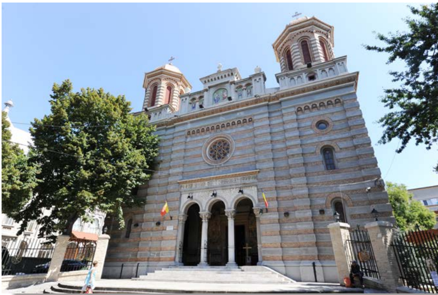
Orthodox Cathedral St. Petru and Pavel