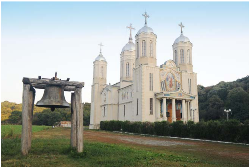
The Monastery of Saint Apostle Andrei

The Monastery also has now a small church situated at a few tens of meters from the cave. The Church was blessed with the patron the Coating of Mother of God.