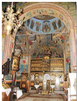
The inside of the old church Saint Gheorghe from Mangalia

The fundamental stone for building this church with the patron Saint Gheorghe and Saint Ioan the Baptist was laid in 1914. The construction was finished in 1929, when it was also blessed.