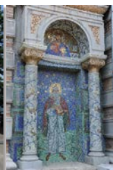
Mosaic detail of St. Andrei