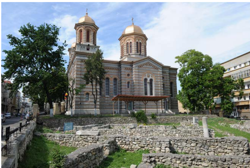
Orthodox Cathedral St. Petru and Pavel

The Cathedral was included on the list of historical monuments of national interest.