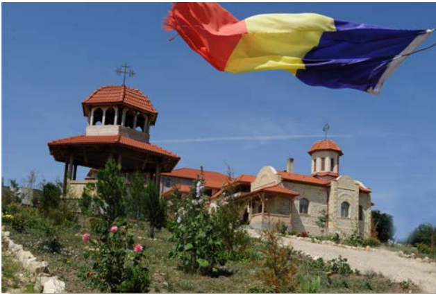
The Monastery of Saint Ioan Casian

Nearby there is the cave "Saint Ioan Casian", arranged as a cell; in the past the monks used the cave as a home and liturgical service area.