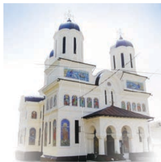
The old church Saint Gheorghe from Mangalia