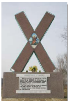
Crucifix of the Monastery St. Andrei