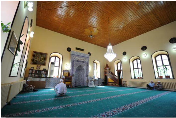
Hunchiar Mosque – Inside