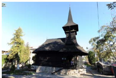
The Hermitage St. Maria Techirghiol