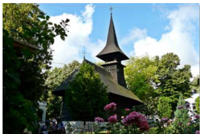
Hermitage Court "St. Maria Techirghiol "

The painting was made in several stages by the local artists, blending the naive style with the late romantic one. In the years 1965 - 1967 and 1975 - 1977, the Hermitage was renovated and extended.