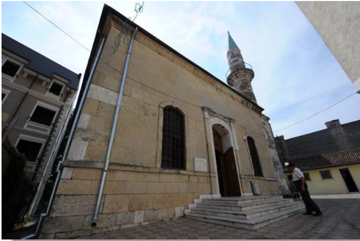
Hunchiar Mosque – Outside

The Mosque is an historic monument of national interest.