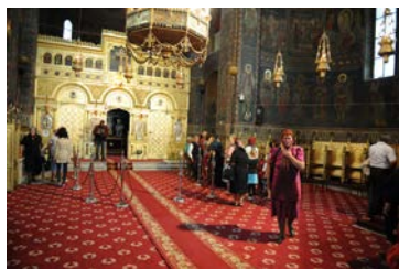
The inside of the Cathedral