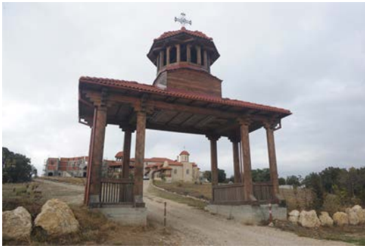
Entrance in the Monastery of Saint Ioan Casian